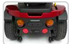
Full lighting package

PRIDE® MOBILITY SCOOTERS LIVE YOUR BEST®