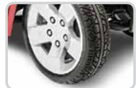
13" Low-profile Tires