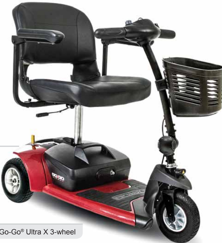
Go-Go ® Ultra X 3-wheel

The Go-Go ® Ultra X is loaded with features such as one-hand disassembly and a convenient drop-in battery box for worry-free travel. With a 260 lb. weight capacity, a maximum speed up to 4 mph, speeds up to 6.9 mph on the 3 wheel and 7.2 miles on the 4-wheel makes it an exceptional value.