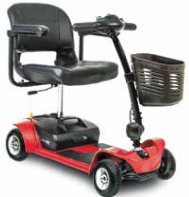
Go-Go ® Ultra X 4-wheel